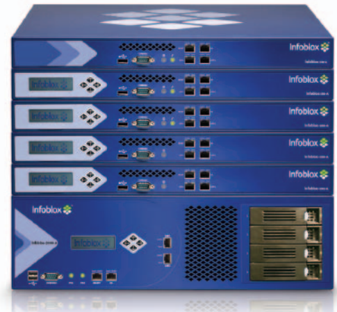
Infoblox Appliance Family (top to bottom) 250-A, 550-A, 1050-A, 1550-A/1552-A, 1852-A and 2000-A

With Infoblox you can reduce the capital and operating costs of your network by up to 50%, while boosting availability and application performance. By automating the delivery and management of network services like DNS, DHCP and IP address management, Infoblox customers consolidate servers and eliminate layers of complex, error-prone network tasks that drive up costs and jeopardize availability.