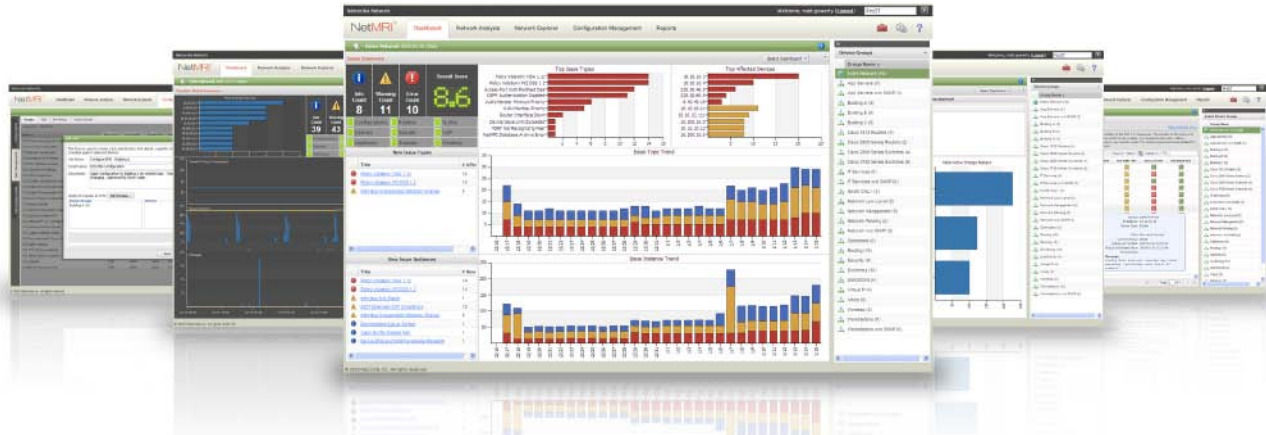
Visually See the Impact of Change to the Health, Policy, and Stability of Your Network